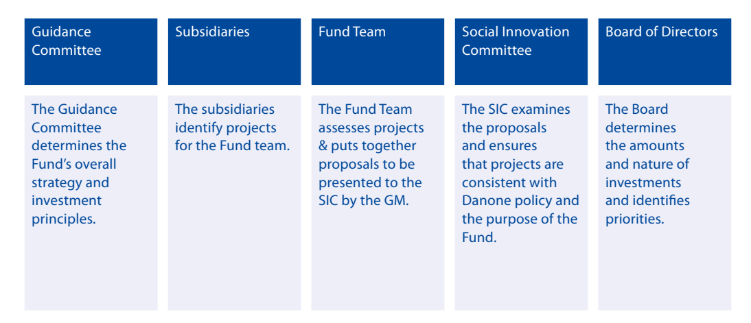
Figure 5: Governance structure of the Danone Ecosystem Fund<sup>64</sup>

of Danone's worldwide business units and 50% from relevant corporate functions such as Communications and Procurement. The committee meets four times a year. Such high involvement from the business units ensures continued buy-in and support from Danone and appropriate level of resources, when necessary.