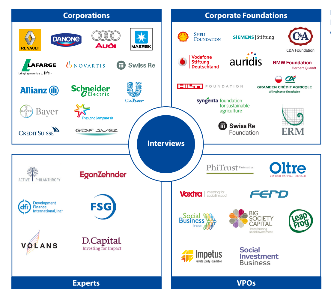
Figure 2: Positioning of interviewed organisations

We decided to select a wide range of interviewees, who represent different angles and play different roles in the venture philanthropy/social investment space. They were selected based on the literature review, as well as on knowledge of specific companies and VPOs that have been involved in recent activities and transactions. Companies and VPOs varied in size, and had broad levels of engagement or experience, which made the set of interviewees even more diverse. Some represent an overlap between sectors (see Figure 2), for example corporate foundations, which may be VPOs at the same time. They were able to share their views with us from both points of view. Experts provided valuable analysis, probed us with additional questions, and corroborated our initial findings thanks to research they had done in the past. We are grateful to all the organisations listed below for the time dedicated to speaking to our research team. It is important to note that we could not develop detailed case studies on all the organisations interviewed. Our approach was to select cases that would illustrate the range of strategies used by our interviewees.