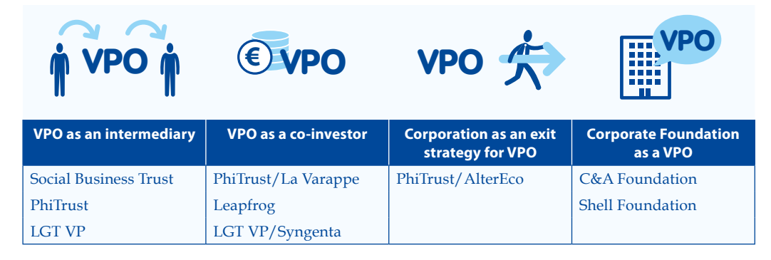
Figure 6: Models of collaboration with examples