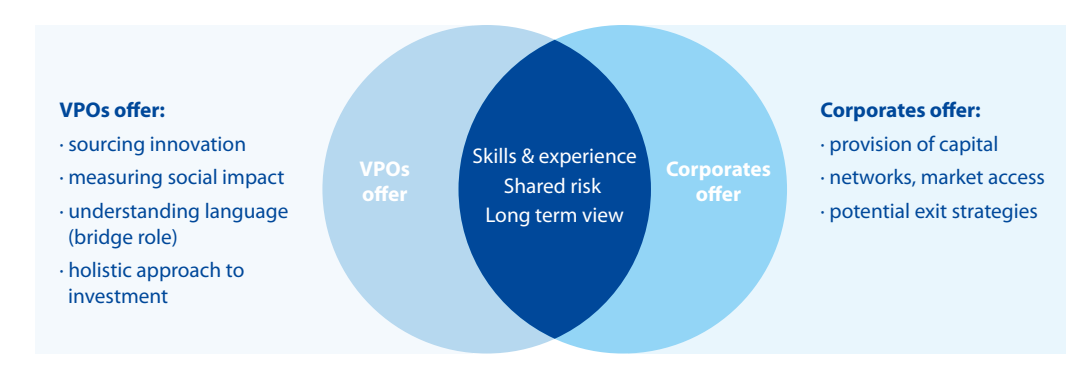
Figure 7: What can corporates and VPOs offer each other?

VPOs can help corporates overcome many of the challenges they face in the social impact investment space. Interviewees recognized that corporates and VPOs are natural partners because they can build on each other's strengths to create mutually beneficial partnerships. They can offer each other benefits that will help the other party achieve the social and financial goals of their investments. Figure 7 outlines the main benefits that each can gain access to by collaborating.